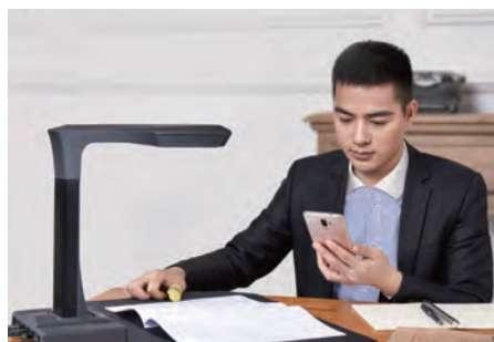
Law / CPA Firm

Scan book, magazine, drawing, picture, blueprint, receipt and so on.