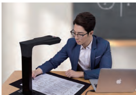
University / School