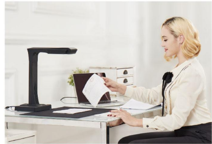
Accounting / Finance