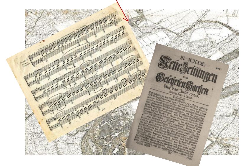
Portrait or landscape format up to <A1