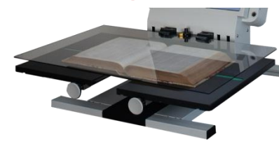
Self-adjusting book cradle