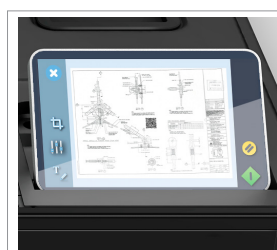
Control the entire scan process from the IQ FLEX built-in touchscreen computer